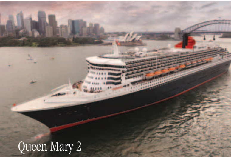
Queen Mary 2

The Cunard ship Queen Mary 2 is a thoroughbred ocean liner, sleek and majestic with classic Cunard hallmarks throughout, including sweeping staircases, towering domed public rooms, a grand ballroom, a full 360° promenade deck. Enjoy the facilities of the ten restaurants, two swimming pools, a casino, theatres, a cinema, computer and internet access, a Canyon Ranch Spa, a planetarium, eight bars and much more. Take part in the multitude of daily activities that include numerous lectures on an array of topics, the regular musical performances, ship sports and much more. A voyage on the Queen Mary 2 is a historic experience to be savoured and remembered!